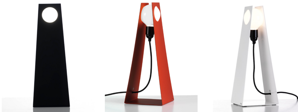
Table lamp made of anodised aluminium, making it a striking element in any living space. With the bold graphic profile, the number of components used has been reduced to an absolute minimum. Black flex in fabric with switch. Bulb included