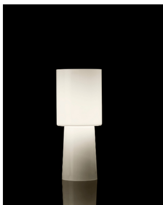
Table lamp 36

Table lamp made out of two geometrical elements in white shiny opal glass; the cylinder and the cone. By the placement of the light source, the light is visible in both shade and foot. The light from the cylinder also goes downwards through the cone. Olle 36 is made in one piece of glass. Black details, white flex with switch.