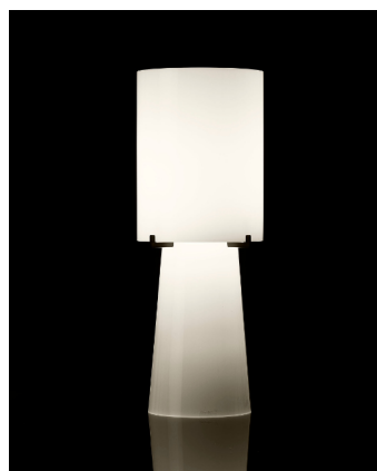
Table lamp 50